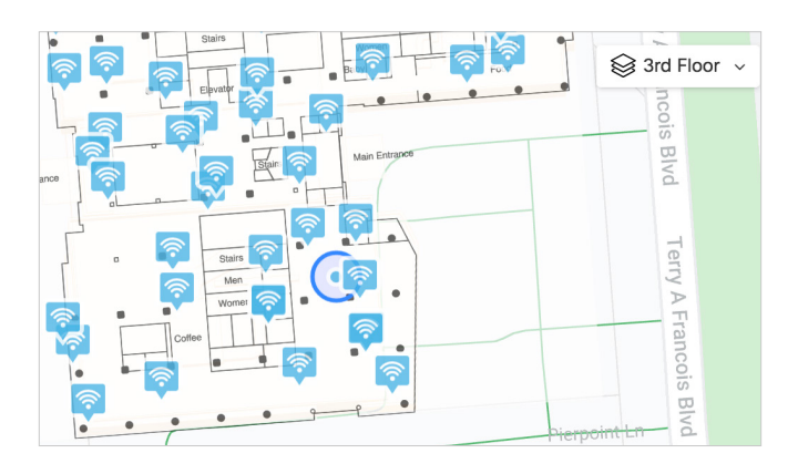
Client location tracking

Combine Meraki MR access points with Meraki cloud-based mobile device management (MDM)—called Meraki Systems Manager—to monitor each of your organization's devices, showing useful metrics including client hardware/software information and recent location, and centrally manage your corporate devices with a great degree of granularity. Log in with remote desktop or command-line, push new applications, and remotely lock and erase devices. Meraki SM provides secure and seamless client onboarding by encouraging devices connecting to corporate Wi-Fi to enroll into Systems Manager and encrypting network traffic between a user's device and the access point.