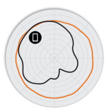
Figure 2. H510 2.4GHz Azimuth Antenna Patterns