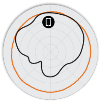
Figure 3. H510 5GHz Azimuth Antenna Patterns