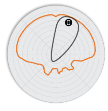
Figure 4. H510 2.4GHz Elevation Antenna Patterns