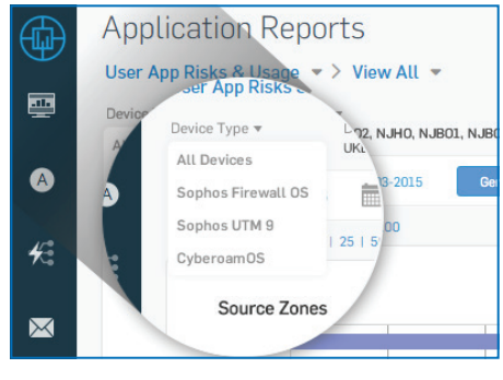
Reports Sophos Firewall OS, Sophos UTM 9 and CyberoamOS devices